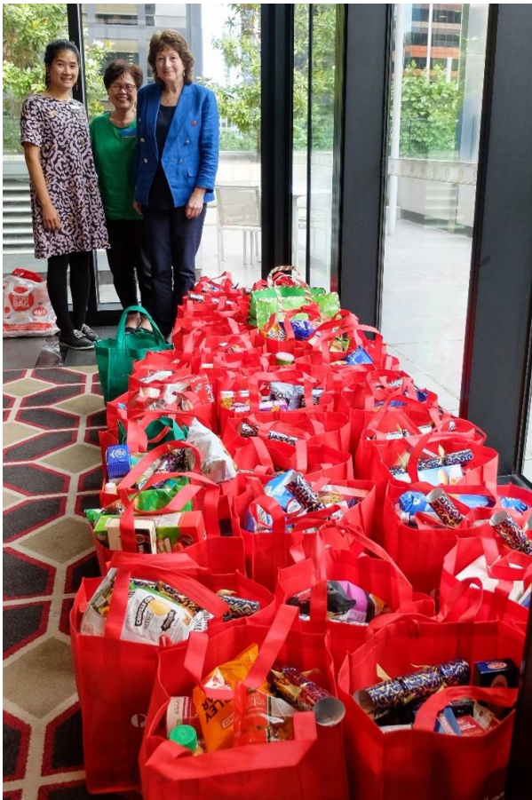
Christmas hampers donated to Concern Australia