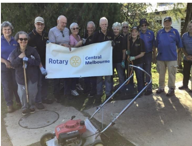
Working bee at Rochester, teaming with sister club Echuca-Moama to restore gardens after the floods.