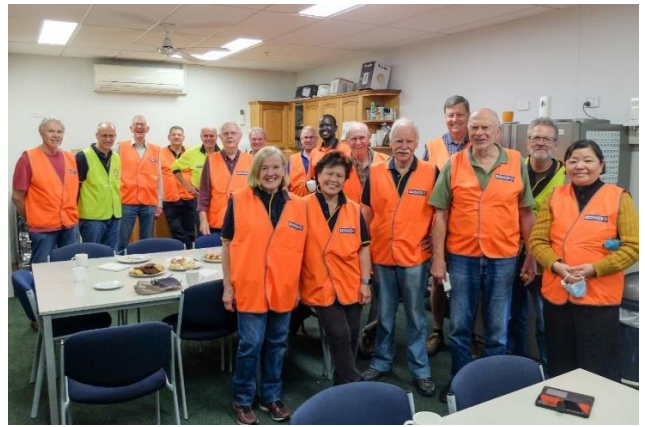
The volunteer team at Donations-in-Kind warehouse, West Footscray