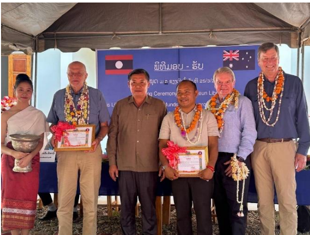
Opening ceremony for the new XiengNgeun Library, Laos.